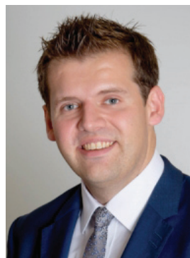
Ben Howlett Member of Parliament Page for Bath